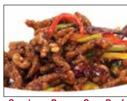
Szechuan Pepper Corn Beef