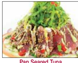
Pan Seared Tuna w. Soba Noodles